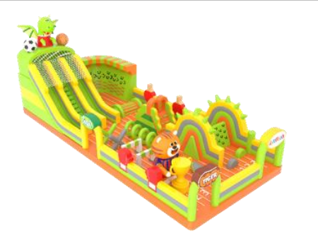
Gear up for action at Tiger's Sports Meet ! Bounce, race, and compete in fun sports activities. Perfect for little athletes to test their skills and have a blast!

A world of sweet surprises awaits at Raby's Choco Candyland ! This sugary paradise, filled with larger-than-life treats, is a dream come true for all dessert lovers.