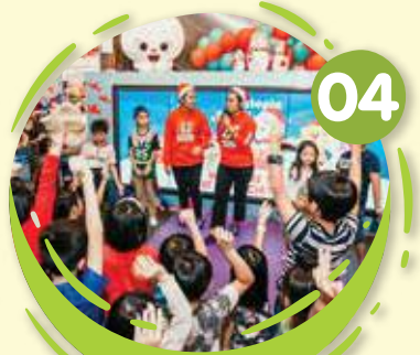
CORPORATE EVENT / GROUP VISIT

Let our team plan a fabulous birthday bash for your child! Packed full of fun and excitement, we promise it will be an ultimate birthday experience your child will remember for years!