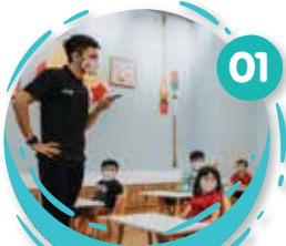
INTRODUCTION & ICEBREAKER